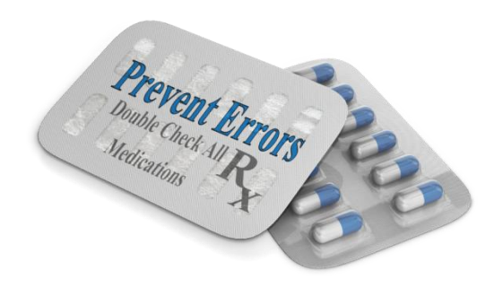
Rights of Medication Administration

Medication should not be administered if these items do not match and medical personnel should be notified and guidance for further action obtained.