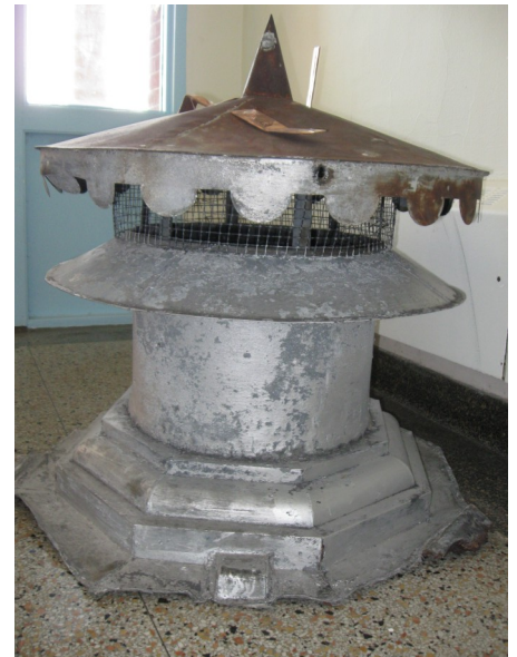
The above decoration sat on top of the old skylight. It is about a foot and a half tall.