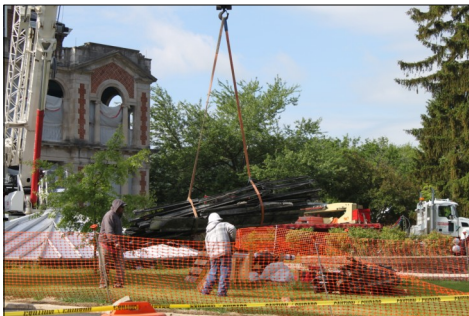
Metal braces from the old skylight