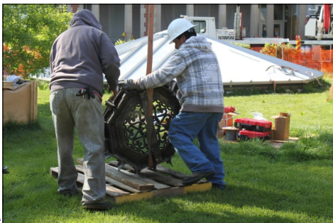
Old light fixture

With the help of the crane, metal from the old skylight was lowered to the ground, then an ornate light fixture that was hidden by the light itself was slowly lowered to the ground.