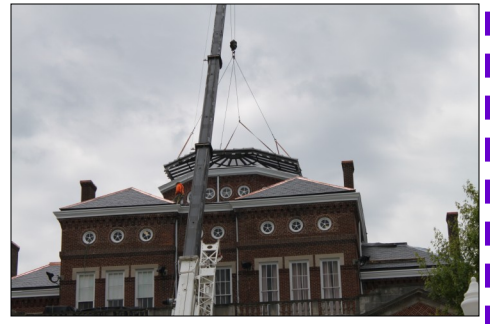
And successful touchdown.

Then the moment of anticipation came. At approximately 1130, the large crane lifted the new skylight, which had been assembled on the lawn in front of the Henderson Building, up off the ground and into place on top of the Henderson Building. The process from ground to roof took less than ten minutes, but seemed flawless from my vantage point on the ground.