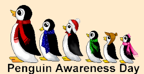
Penguin Awareness Day