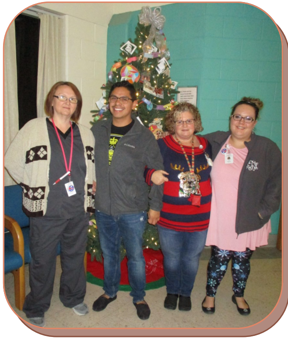
Nightshift Staff Enjoying the Holidays!