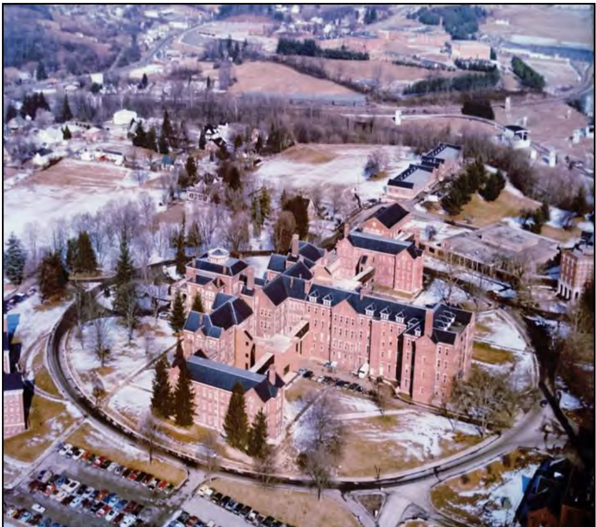
The original Henderson Complex

Department of Behavioral Health and Developmental Services