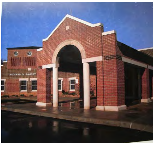
Entrance to Bagley Building