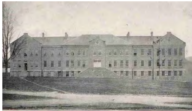
Criminal Insane Building—Southwestern State Hospital.

Eight acres of land was bought that bordered the front lawn and was within 300 feet of the main building in 1910. Three dwelling houses, each containing seven rooms, were built near the hospital to be rented to employees. A complete brick plant with the capacity for 25,000 bricks per day was also built in preparation for building the new Criminal Insane Building. It was anticipated the new building would